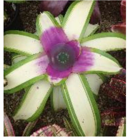
Neoregelia 'Arctic Blast'

Vriesea: white cloud, frost bite, snow in summer, snowman, snow white.